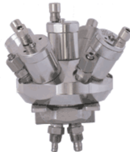
APSON 2C Switching Block XMY-2009 HB with Backpropagation

This type of switching block is particularly suitable to the employment in automatic coating systems with often to change chemically aggressive media, e.g. lacquers, hardeners, solvents, caustic solutions, a.o. It is applicable both for 2C normal lacquers and 2C metallic lacquers.